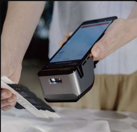
Retail Inventory Counting & Checkout