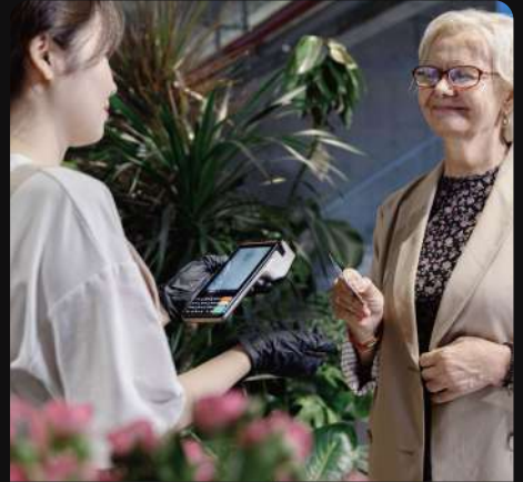
Designed for the Visually Impaired

*The above scenarios apply to P3/P3KH/P3H.